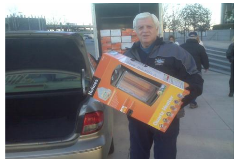
Volunteers delivered 120 portable heaters to VNA’s Meals on Wheels clients during the “Heater Bowl.”