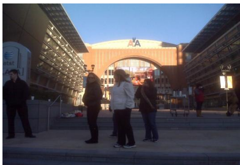
Sunlight breaks over Victory Plaza outside the WFAA Channel 8 studios as volunteers await the next drivers to arrive to pick up heaters.